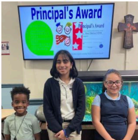
King Williams PS